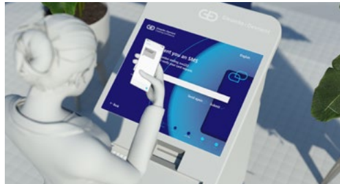
The customer authenticates and activate the card via their banking app.