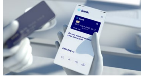
Customer authenticates their identity through digital banking app, scans the QR code and the new card is active. Optionally, the QR code could also link to other campaign URLs from the issuer.