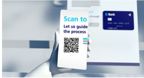
Unique QR Code generated at the time of personalization and is sent to customer through email or SMS.