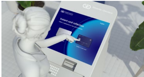
Non-personalised generic cards are sent to a location for customer collection via automated dispenser or staff.