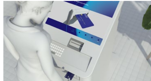
The card is issued to the customer for remove immediate use.