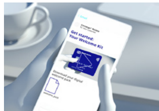
Download digital carriers with our new video booklet