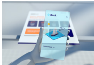
A QR code linking to tailored offers