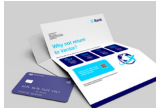
Targeted marketing letters