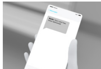
Augment print channels with rich SMS and email