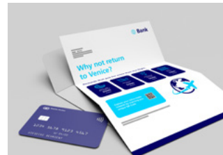
Targeted marketing letters